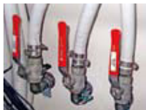
1998 boat built to RCD with non-marine brass valves