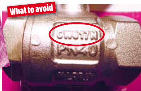
Brass valve removed from packaging and turned over to show marking