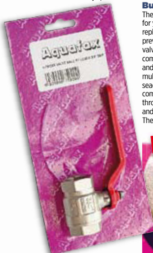
CW617N brass valve – but the marking is on the back of the valve thus not visible in packaging

The marking 'CW617N' is the European designation for ordinary brass with a high zinc content. Ball valves are made in their millions using this material, because they perform so well in freshwater plumbing and piping systems,