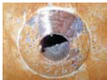
2009 boat: through-hull already showing the pinkish spots of local dezincification