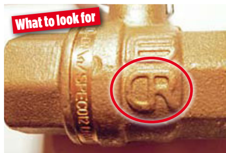
DZR brass ball valve with 'CR' (corrosion-resistant) marking

'What on earth are we doing using an inferior material for such vital fittings below the waterline?'