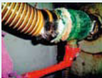
Most modern boats have gate valves. This one needs replacing