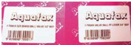
ABOVE: Packaging for ball valves, the DZR brass one is marked but the plain brass one is not

The situation is even more difficult for yacht owners and yards replacing fittings as part of good, preventative maintenance. The ball valve has become by far the most common type of seacock used and immediately the problem is multiplied, compared to traditional seacocks, because there are three components in the assembly: the through-hull fitting, the valve and the tailpipe to take the hose. These components may have been