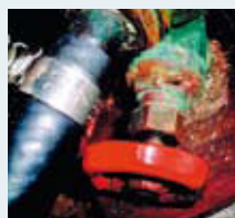
Many used boats have gate valves. This one is terminally corroded

'As a surveyor, I have seen hundreds of brass seacocks and associated fittings that are unfit for use in salt water, on a wide range of boats'