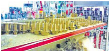
Components are often sold loose. This chandler explains the difference